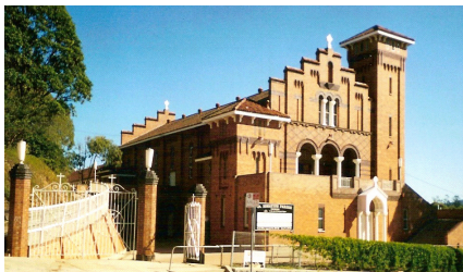
St Ignatius Church Kensington Terrace, Toowong