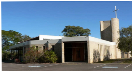
Holy Spirit Church Harriett Street, Auchenflower