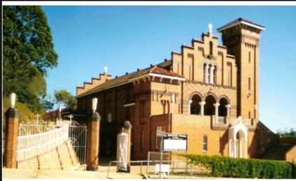
St Ignatius Church Kensington Terrace, Toowong