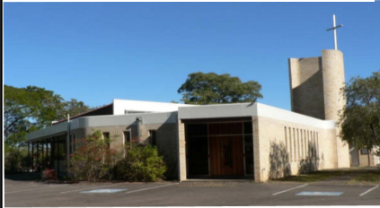
Holy Spirit Church Harriett Street Auchenflower