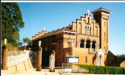
St Ignatius Church Kensington Terrace, Toowong